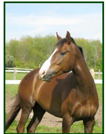
Introducing Yoshi: He will be competing in the Young Event Horse competitions this year